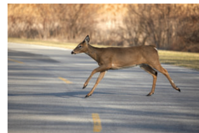
Figure 1 Understanding the physics of motion can help you prevent accidents.

For motion with constant acceleration, motion equations relate five variables: the object's initial velocity, its final velocity, its acceleration, its displacement, and the time interval.